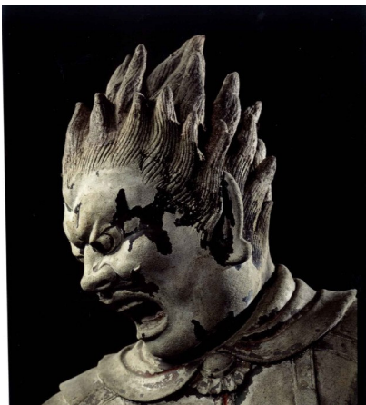
Figure 3 Irie, Taikichi. Photograph of Statue of Basara Taisho, taken December 1976. Original is a gift of the Nara City Council 1997. Owned by the Legislative Assembly.

As part of the sister city relationship with Nara, the Mayor of Nara offered an exhibition of the works of the Japanese photographer Taikichi Irie to coincide with his visit in 1997 was arranged. 105 In association with the exhibition was an extension program 106 . This exhibition led to the donation of 30 photographs from the exhibition. 107 The Belconnen Library exhibited the photographs during the Multicultural Festival in January 1998. 108