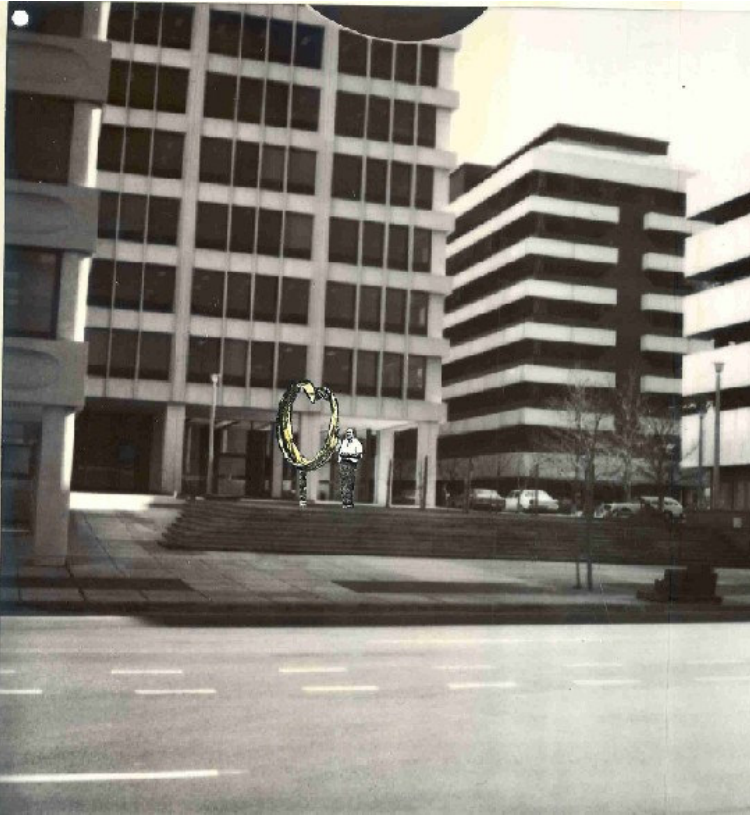
Figure 2 Photograph of proposed site of Mortality, with Mortality superimposed on the Darwin Place site, viewed from London Circuit. Folio 33. Chief Minister's Department. National Capital Development Commission. 82/730 Mortality sculpture by John Robinson