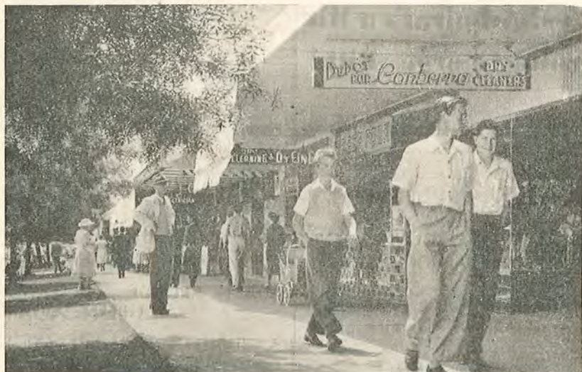
A BUSY SCENE IN GILES STREET, KINGSTON

NISH & JOYCE SPORTS DEPOT GROUND FLOOR, KINGSTON