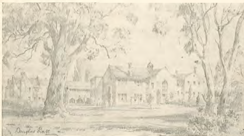
CANBERRA GRAMMAR SCHOOL

In addition, the numerous pre-school play centres for tiny tots are well worth inspection.