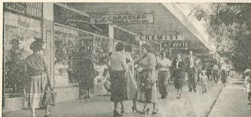
SHOPS AT KENNEDY STREET, KINGSTON

Principal shopping and business centre in the Australian Capital Territory south of the Molonglo River.